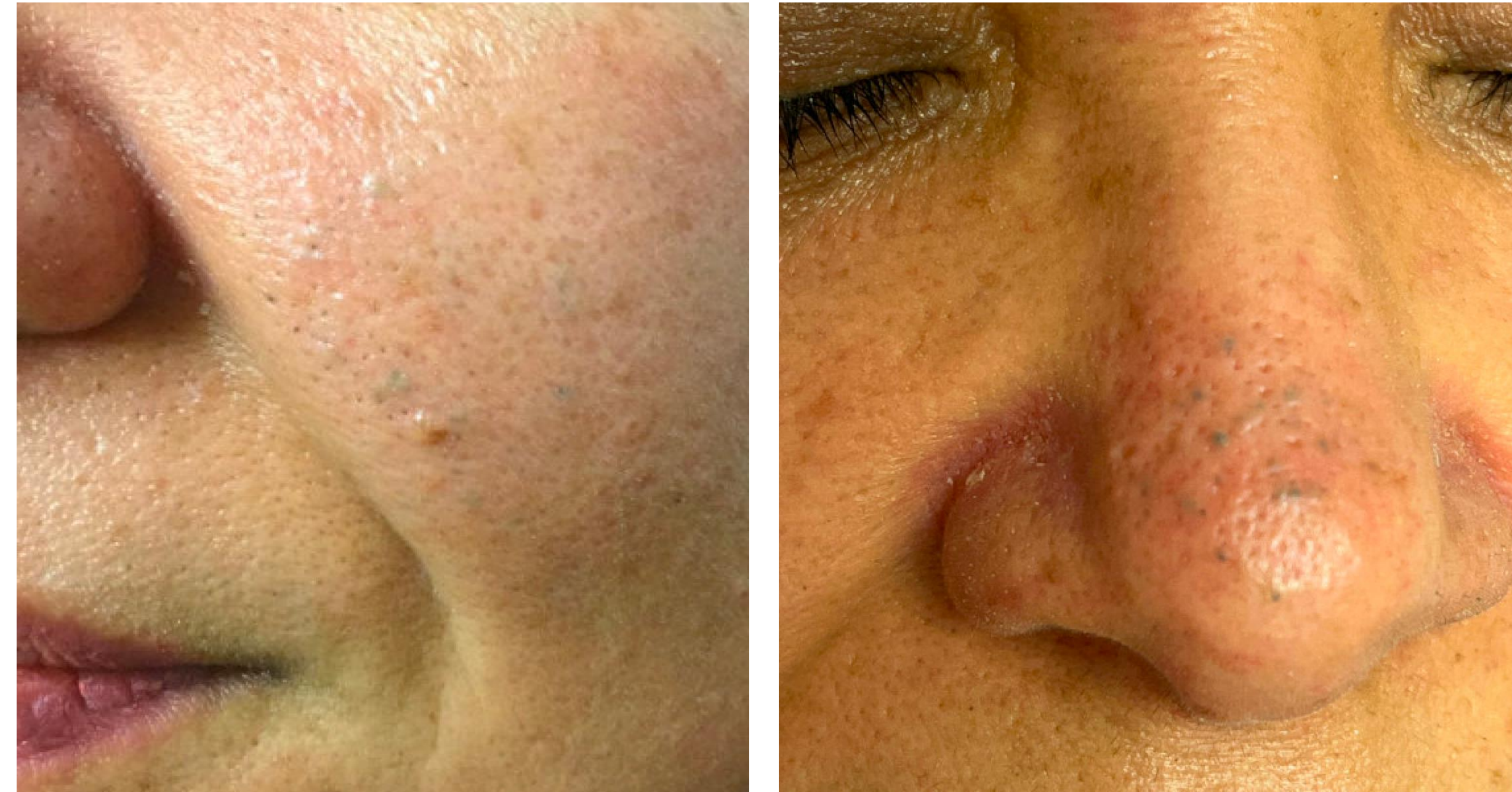
Figure 1 (Above): Patient presentation photos

Over two dozen blue-black perifollicular macules were present across the cheeks bilaterally (left) and across the bridge of the nose (right). Additionally, several lesions were scattered across the chin. Initial differential diagnoses for such blue-black perifollicular macule included blue nevi, exogenous or drug-induced hyperpigmentation (such as argyria), dilated pore of winer/comedone, and hidrocystoma.